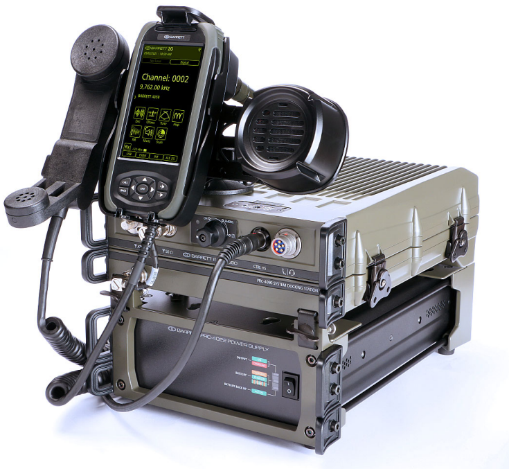
The 500W tactical HF transmitter natively supports the Barrett PRC-4090 HF SDR Transceiver/Exciter

The 4075 linear amplifier is designed and engineered for modern communications which are heavily data orientated, requiring the equipment to work at high duty cycles for extended periods of time. The unique liquid cooled design increases cooling efficiency resulting in less system deterioration due to overheating in the power stages, extending overall equipment service life.